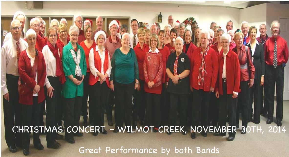
CHRISTMAS CONCERT - WILMOT CREEK, NOVEMBER 30TH, 2014

Don't forget if you go to Boston Pizza in Bowmanville write Lakeshore New Horizons Band on the back of your bill and deposit in the box near the door. The Band will receive 10% of the food total....great fundraiser