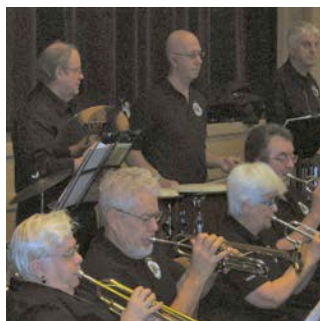
Durham Christian Homes Concert